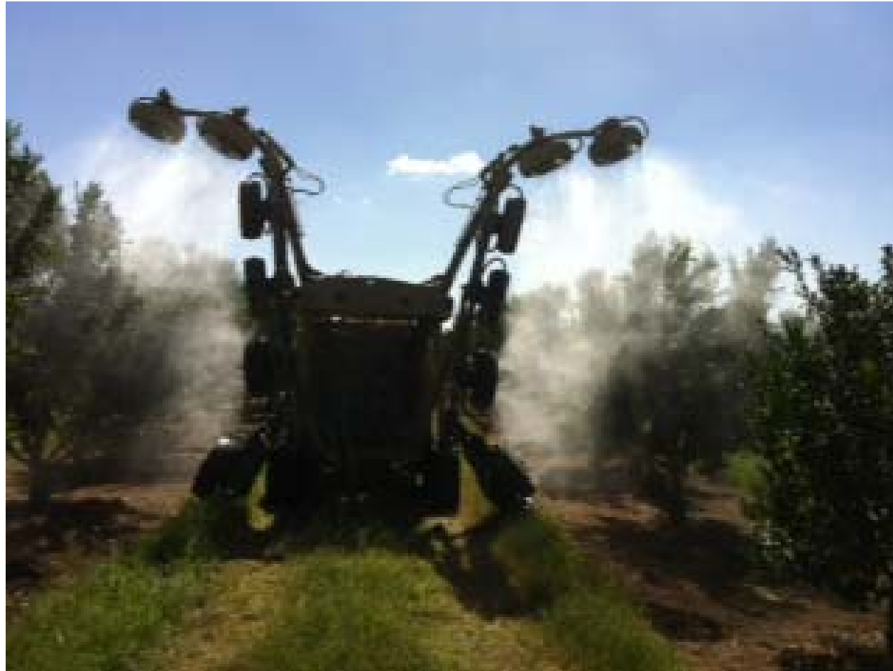
Air Blast spray rig applying 4 000L/ha