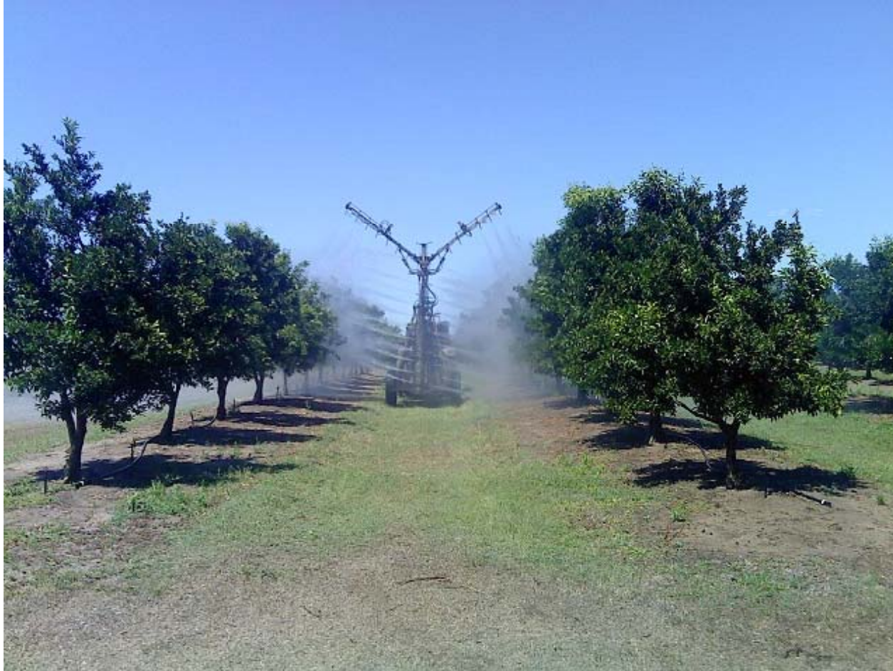
Oscillator spray rig applying 8 000L/ha