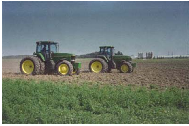
Figure 2. Tire inflation demonstration at MSU's Ag Expo