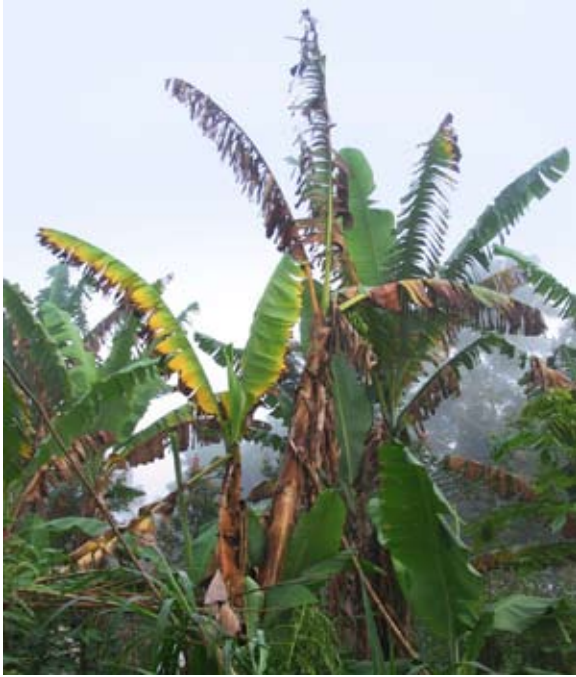
As the disease progresses, older leaves die and form a skirt around the lower part of the plant