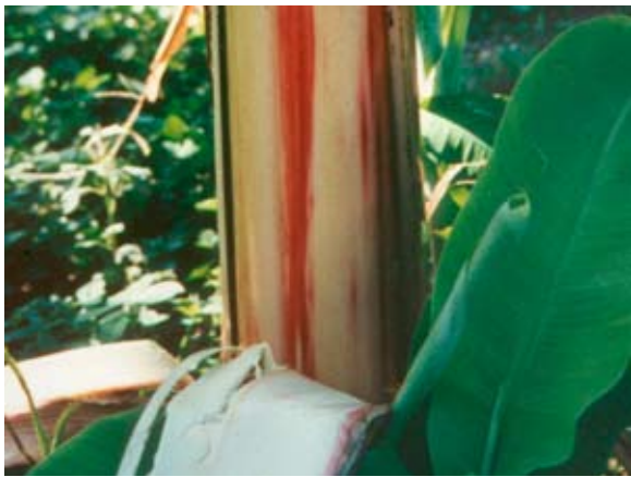
Reddish-brown spindle-like streaks can be seen on the stem when the dead outer leaves are removed

If you see anything unusual, call the Exotic Plant Pest Hotline on 1800 084 881.