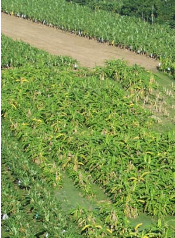
Aerial view of Panama affected banana plants