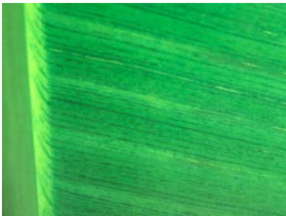
Typical bunching of emerging leaves