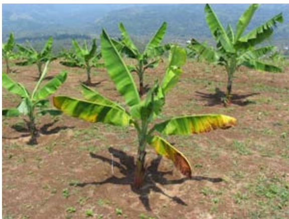
Internal browning of stems and corms is the key diagnostic symptom of Panama disease