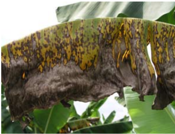
Advanced Eumusae leaf spot symptoms