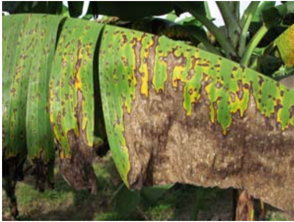
Eumusae leaf spots on banana leaf