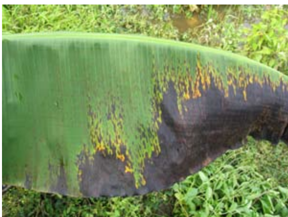
Advanced stage of black Sigatoka on banana leaf

Leaf symptoms of black Sigatoka are very similar to those produced by yellow Sigatoka (present in Australia) and Eumusae leaf spot (not present in Australia).