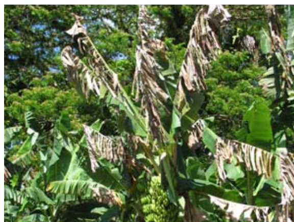
Black Sigatoka-infected banana plant