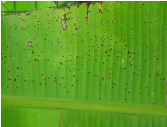
Sharon Van Brunschot

Banana freckle is a disease of banana leaves and fruit. It is caused by the fungus Guignardia musae . A strain of this fungus that infects Lady Finger and Bluggoe bananas occurs in Australia, but the strain that infects Cavendish bananas (Cavendish strain) does not currently occur on mainland Australia.