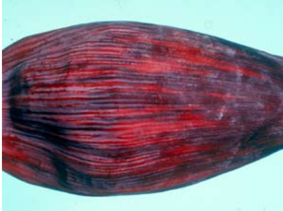
Dark red-brown mosaic pattern on flower bracts