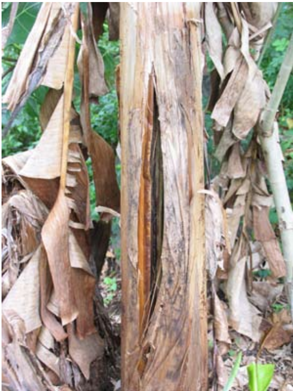
Splitting of the pseudostem associated with Panama disease infection